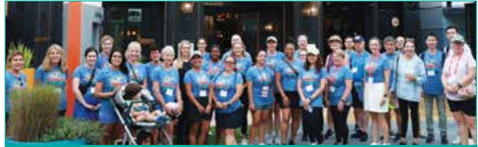
2024 Health Walk participants

year's nine Kelly Scholars into the AAOMS community, providing them the VIP treatment throughout the Meeting's events. They were greeted as guests of honor at the Alliance's daily Health Walks along International Drive, networking