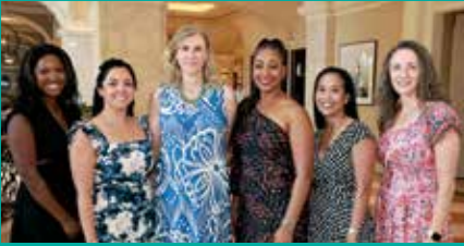
2024 Alliance Committee

This year, the OMS Foundation Alliance celebrates its 30th anniversary, marking three decades of collaboration between OMSs, their spouses, families, allied staff and friends. The Alliance, which is the Foundation's primary outreach and fundraising partner, is committed to promoting the health and social issues related to the specialty of oral and maxillofacial surgery. But the Alliance also has made priceless contributions to building the AAOMS community, starting in its very first year of existence.