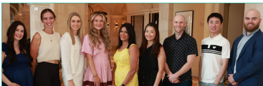
Nine 2024 Norma L. Kelly Resident Spouse Scholars