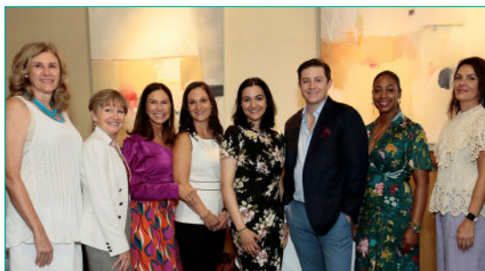
2022 Alliance Committee and two Norma L. Kelly Resident Spouse Scholars

Learn more and apply at OMSFoundation.org/Alliance/Scholarships . Questions? Email info@omsfoundation.org .