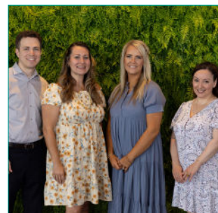
Four 2023 Norma L. Kelly Resident Spouse Scholars