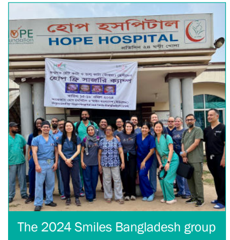
The 2024 Smiles Bangladesh group

His volunteerism highlights the remarkable impact of the GIVE program, and the Foundation is honored to support such meaningful initiatives. ■