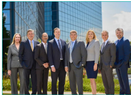
OMSNIC Board of Directors