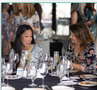
Good conversation at the Luncheon and FUNraiser