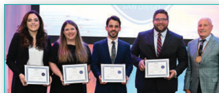
Laskin Award recipients