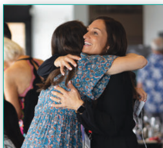
Friends reunite at the Luncheon and FUNraiser